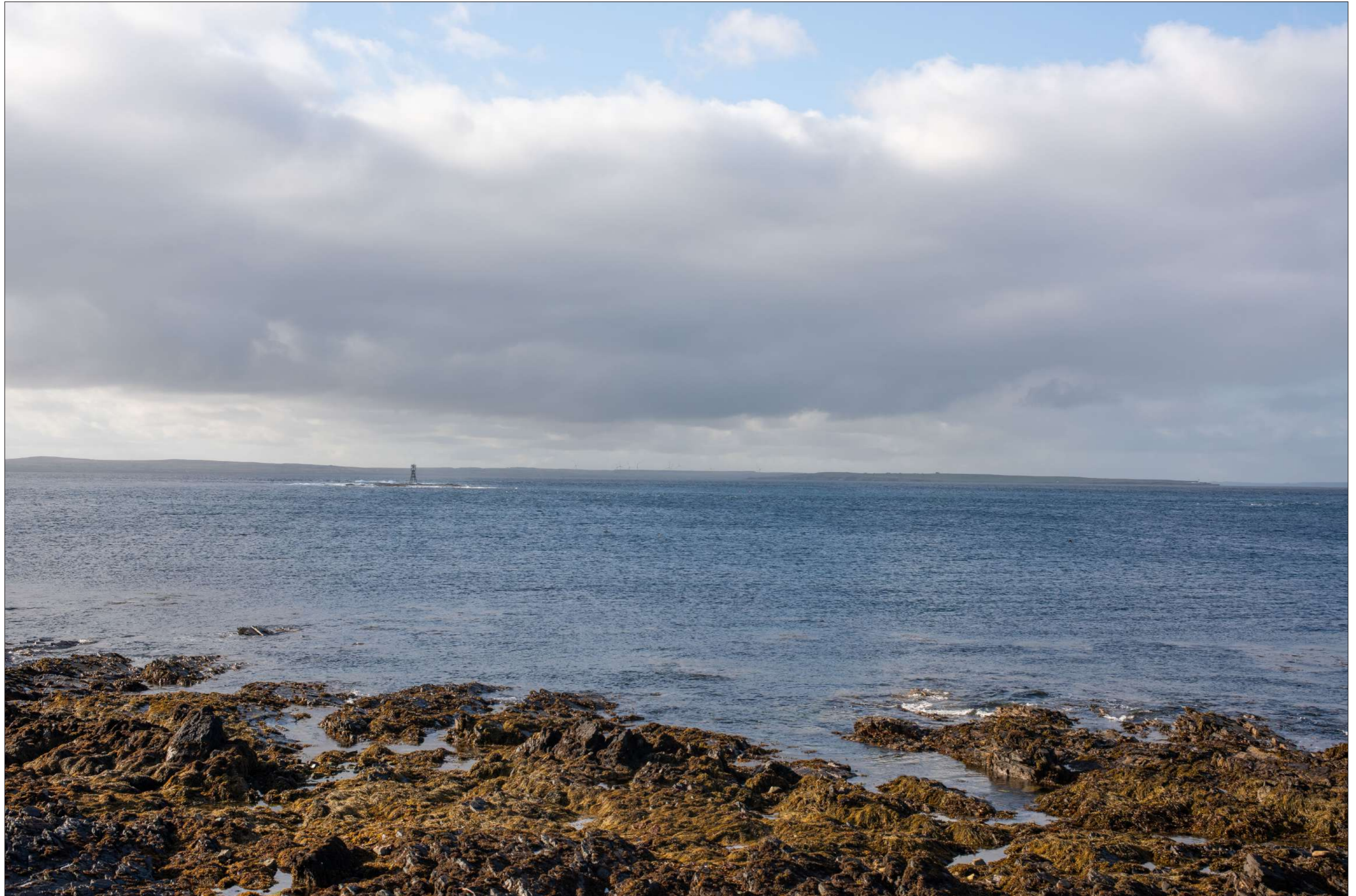
Figure: 7.15-THC-03 Viewpoint 2: Burwick, South Ronaldsay

When viewed at a comfortable arm's length (approx. 500 mm), this printed image is representative of our detailed central vision, but is not representative of scale and distance.