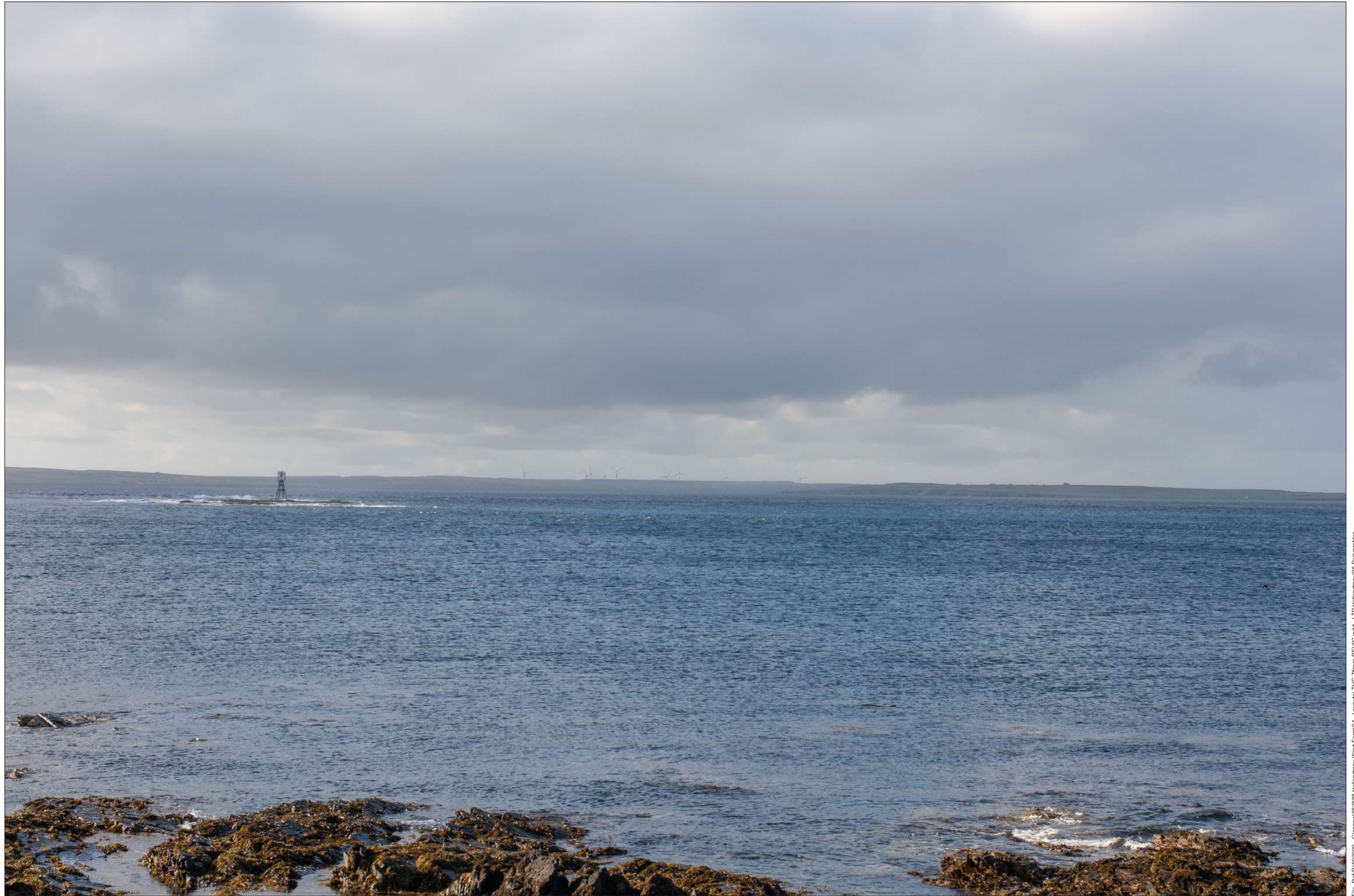
Figure: 7.15-THC-04 Viewpoint 2: Burwick, South Ronaldsay

This image should be viewed at a comfortable arm's length (Approx. 500 mm)